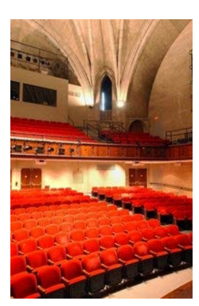
The Charity Randall Theatre