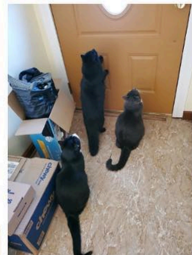
Staring at the door